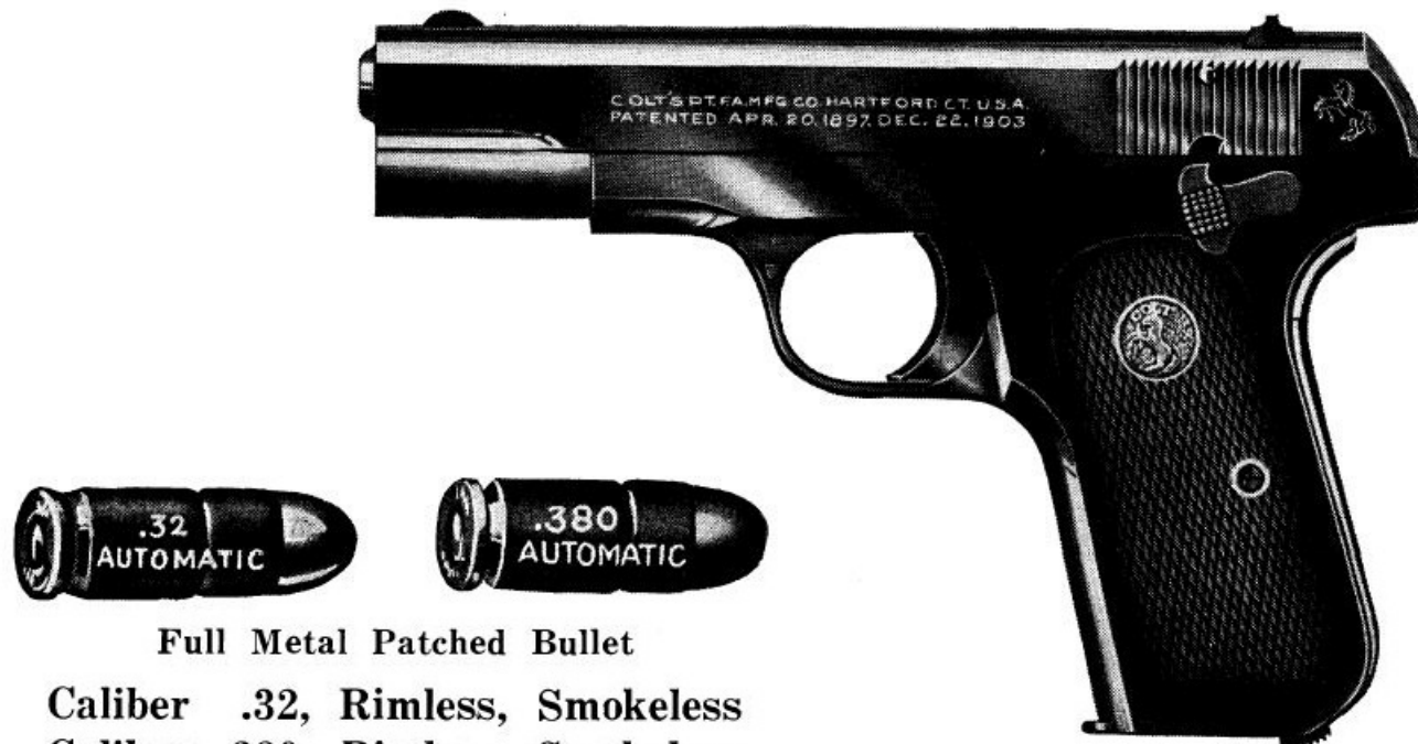
Full Metal Patched Bullet

Caliber .32, Rimless, Smokeless Caliber .380, Rimless, Smokeless