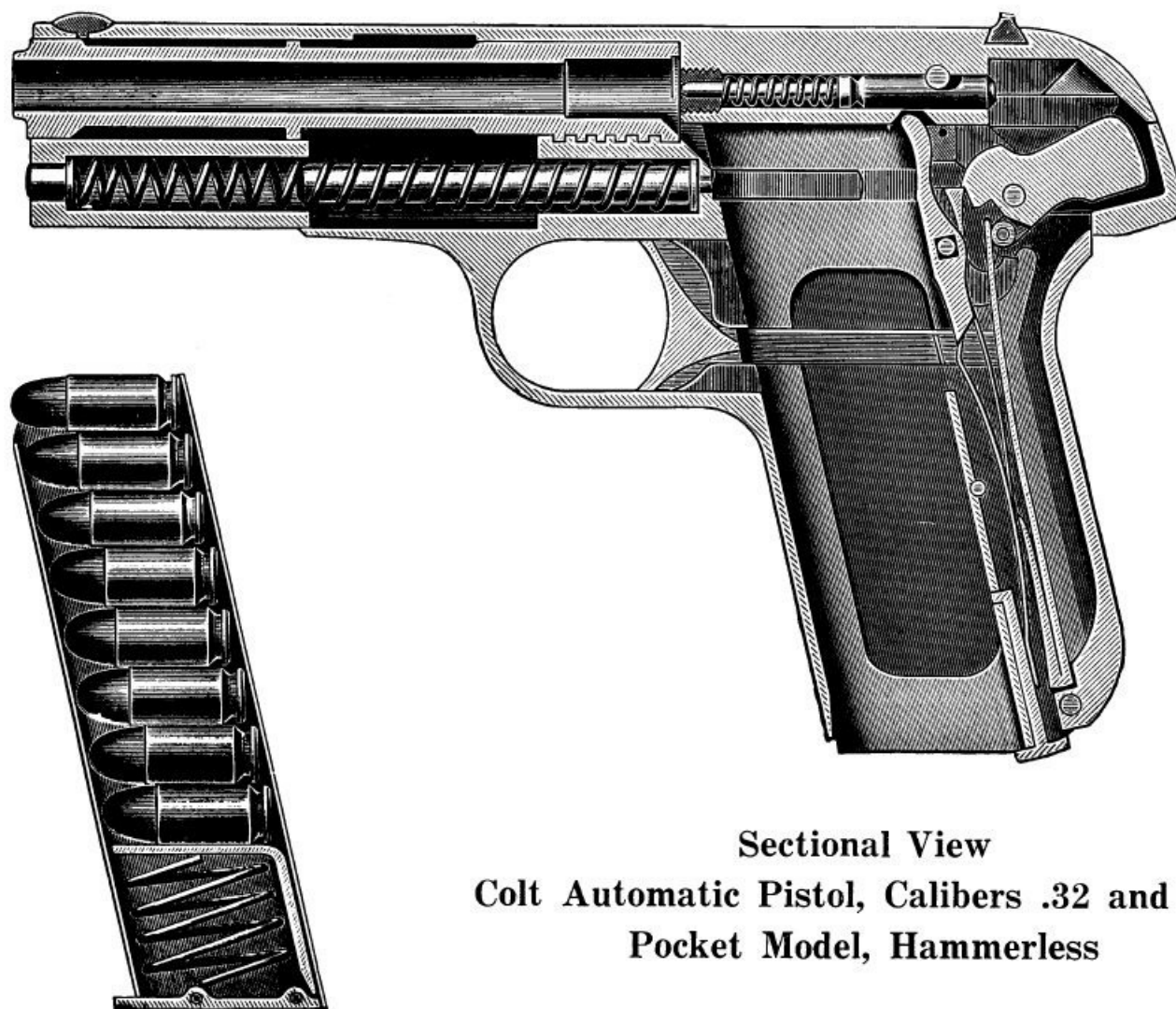
Sectional View Colt Automatic Pistol, Calibers .32 and .380 Pocket Model, Hammerless